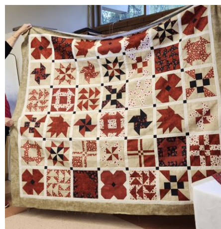
Quilt of Valour top, as shown at December Xmas Mtg.